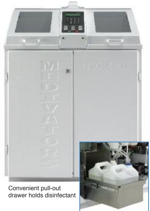
Convenient pull-out drawer holds disinfectant