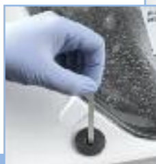
Easy testing of high level disinfectant concentration